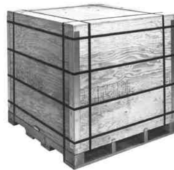
Signode steel strapping and plywood can be combined to fabricate 300 gal. (1140 l) storage containers used to store and ship a myriad of industrial products.

Zinc finish strapping is waxed and has a zinc enriched coating to provide outstanding resistance to rust. Available in a variety of Apex and Magnus sizes, it has the same improved tension transmission characteristics as the painted and waxed strapping. Zinc finish protects where it is needed most—at points of surface damage and scratches.