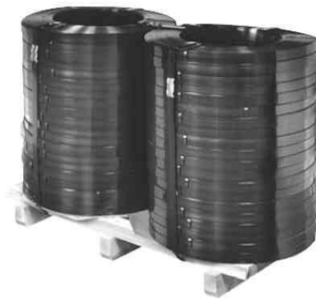
Ribbon wound skid