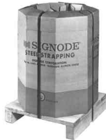
Mill wound skid

1-1/4" x 0.031" (31.75 x 0.8 mm) painted and waxed Magnus is available in a 220kg coil. Other Apex or Magnus sizes can be produced in 200kg or larger coils on a special manufacture basis. Contact your Signode sales representative for details.