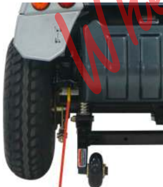
Freewheel Lever 11

Always ensure the lever is fully re-engaged before driving.