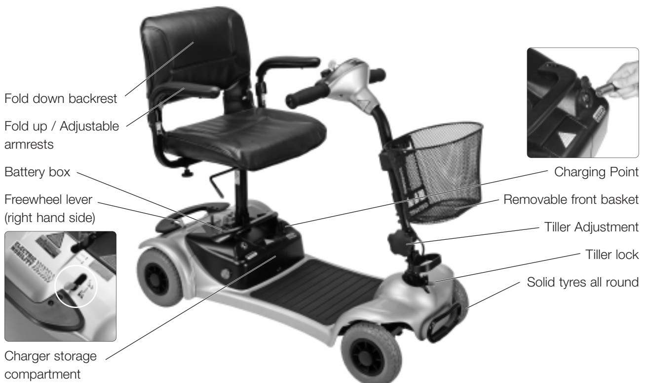
Photo shows UltraLite 480 model scooter. The UltraLite 380 is a 3 wheel version. See the specification for differences.