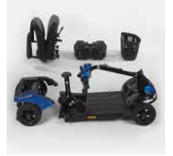
Effortless Dismantling It takes less than a minute to take the Invacare Colibri apart ready for transportation.