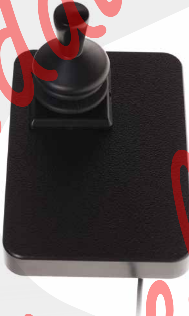
Paediatric compact Joystick