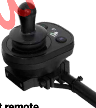
Compact remote with LED display Joystick