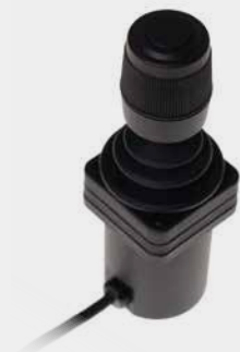
Single switch Joystick