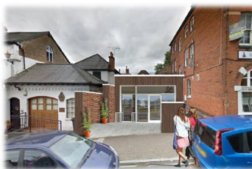
Artist Impression for illustration purposes only. Any shown external materials are subject to conditions & approval by the council