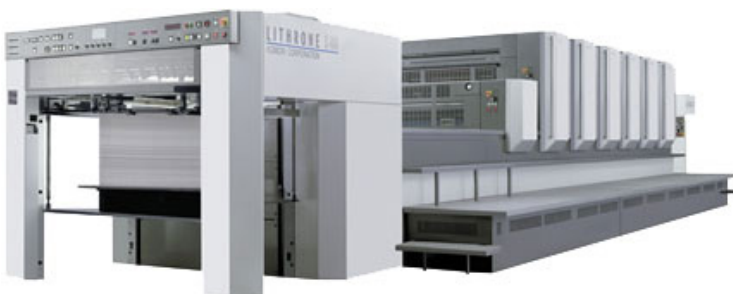
Sheetfed Offset Press

The solution is to position a 1250 Bar so that it is within 50mm of the sheet, avoiding the grippers, as it travels towards the delivery.