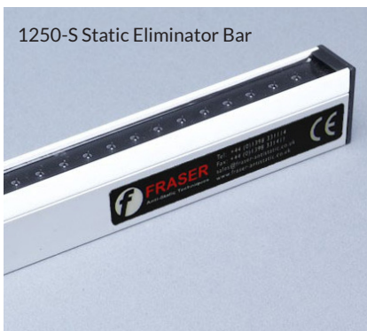
1250-S Static Eliminator Bar

The solution is to position a 1250-Slot Bar to neutralise the pad as it travels between the product and the plates.