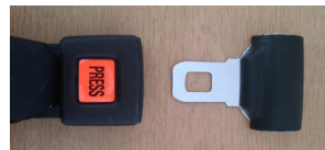
Press Release Vehicle Buckle