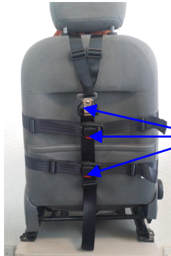
50mm Side Squeeze Buckle