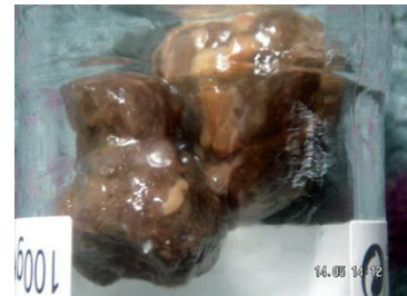
Mould fungal balls from a client's intestine said to be the same species as those present in her home.

If you would like to read any more information on the hazards of mould please see below some of the most respected organisations in the world: