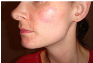
Client with mottled and burning skin caused by hidden mould exposure