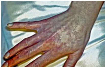
Client with mottled and burning skin caused