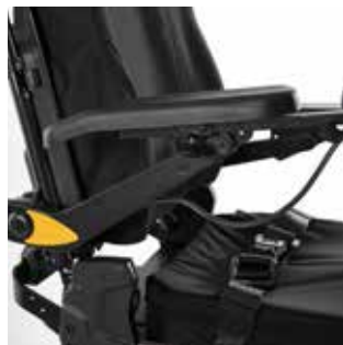
Flip Back Armrest