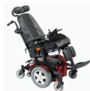
Powered fixed pivot tilt option

The new, simplified powered tilt option allows the seat angle to be positioned up to 20 degrees with no reduction in occupant weight.