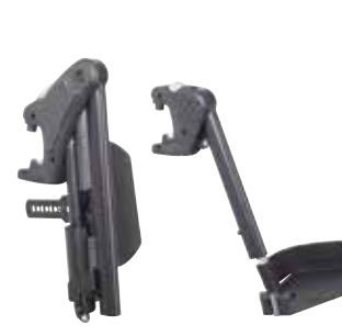
Side mounted legrest

A dedicated lower profile inner frame, along with 'tilt' and 'lifter and tilt' provide an optimised 'seat to floor' height.