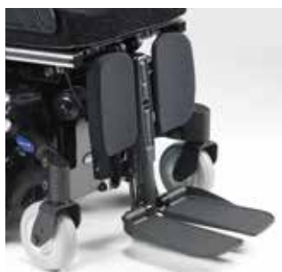
LNX powered centre mount

A maximum seat angle of 30° ensures comfort and safety as well as including a centre of gravity shift.