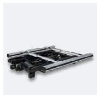
Module™ Telescopic inner frame

This option features a high pivot point for natural movement as well as a quick release mechanism for easy folding and transportation.