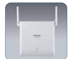
KX-NCP0158 8ch IP Cell Station