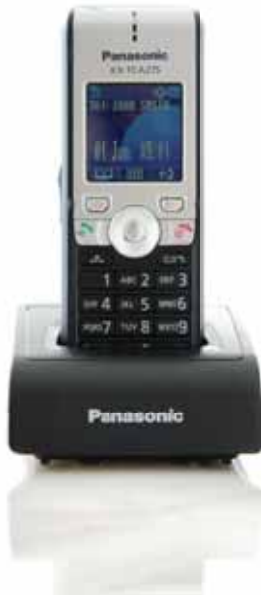
KX-TCA275 Compact Business Model