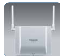
KX-TDA0158 8ch Cell Station