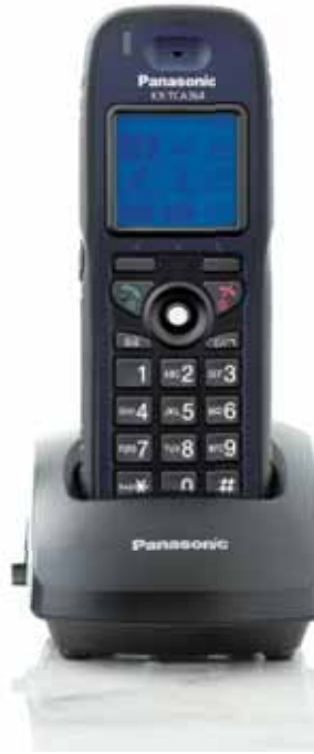
KX-TCA364 Tough Type Model