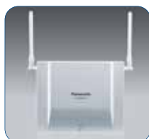
KX-TDA0155 2ch Cell Station