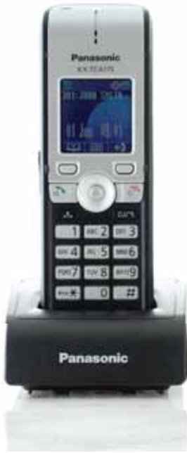
KX-TCA175 Standard Model