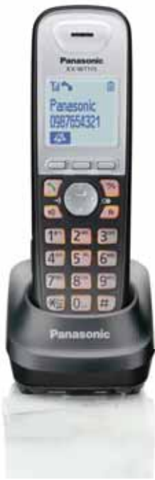
KX-WT115 Entry Level Model