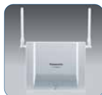
KX-TDA0156 4ch Cell Station