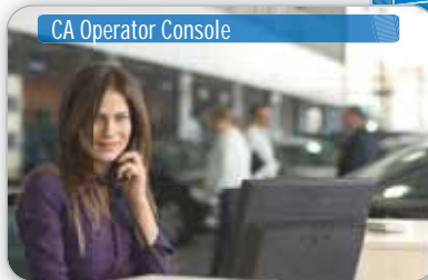
CA Operator Console