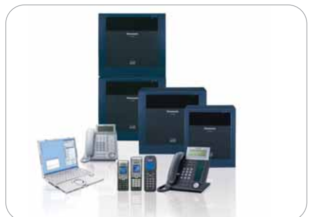
THE TDE SERIES COMMUNICATION PLATFORMS

Convergence ready, modular, extensible, flexible, SIP enabled, and providing built-in support for unified communications productivity applications; the KX-TDE series are ideal communication platforms for customers to solve all their business communication needs today as well as in the future as they embrace Unified Communications together with full IP telephony. These systems are designed to be easy to install, cost effective to run and quickly provide a good return on investment.