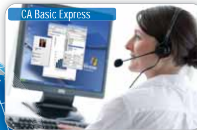
CA Basic Express