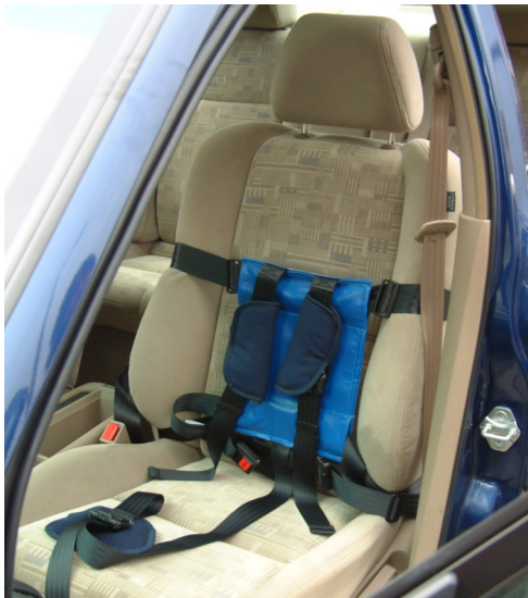
M.27A - 5 yrs to 8 yrs

It is not a safety harness & should be worn in conjunction with the vehicle safety belt.