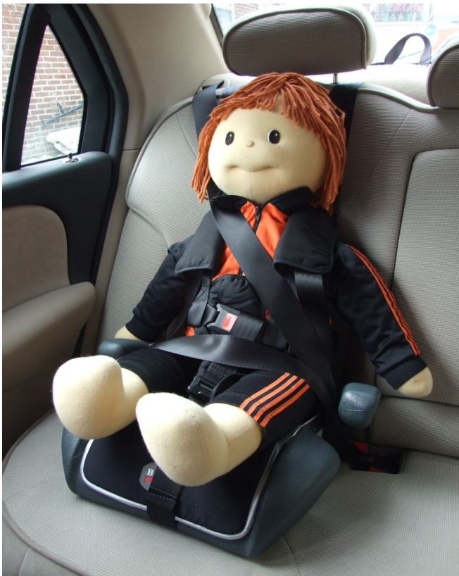
Illustrating one of our harnesses fitted in conjunction with the existing vehicle safety belt.

IMPORTANT: This harness is not classed as a safety harness, but a low risk medical device. The vehicle safety belt MUST be worn over the top of our harness unless they are exempt for medical reasons. The combination on the existing safety belt & the secondary harness offers added security for the passenger.