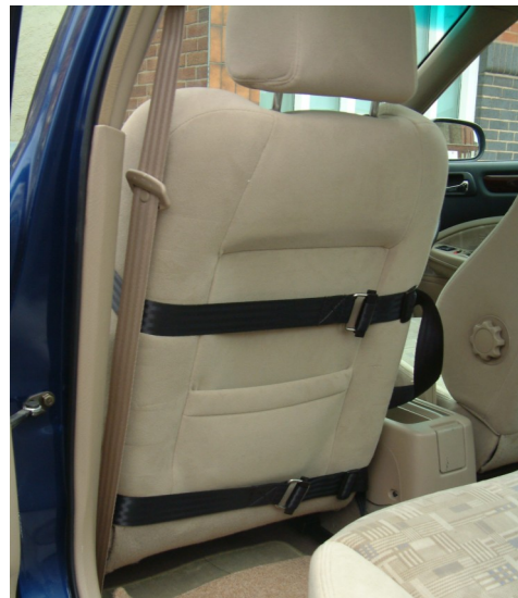
M.27 Fixing Straps

This harness is available with a choice of buckle on the waist belt:-