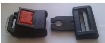
Press Release Buckle