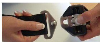
Steel Safety Buckle